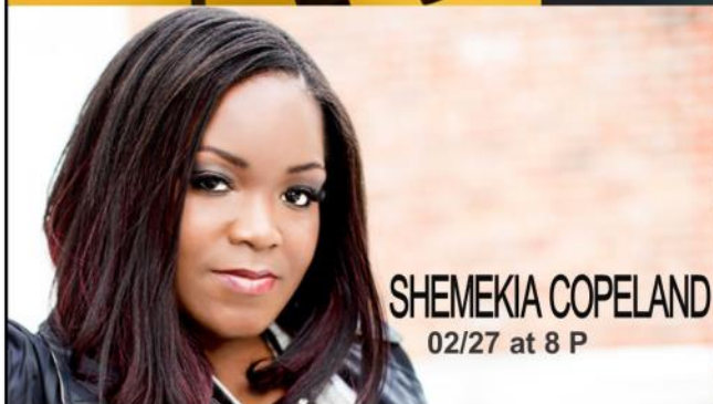
SHEMEKIA COPELAND 02/27 at 8 P