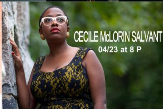
CECILE McLORIN SALVANT 04/23 at 8 P