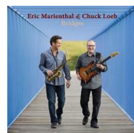
Bridges Marienthal & Loeb

CD of the month is your choice! The tally of reader responses determine the spotlight. Send your favorite CD titles for preview and voting consideration to: shjackson@cau.edu .