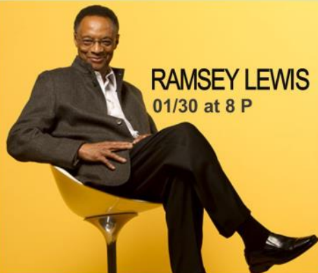
RAMSEY LEWIS 01/30 at 8 P