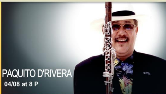
PAQUITO D'RIVERA 04/08 at 8 P