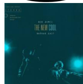
The New Cool Bob James & Nathan East